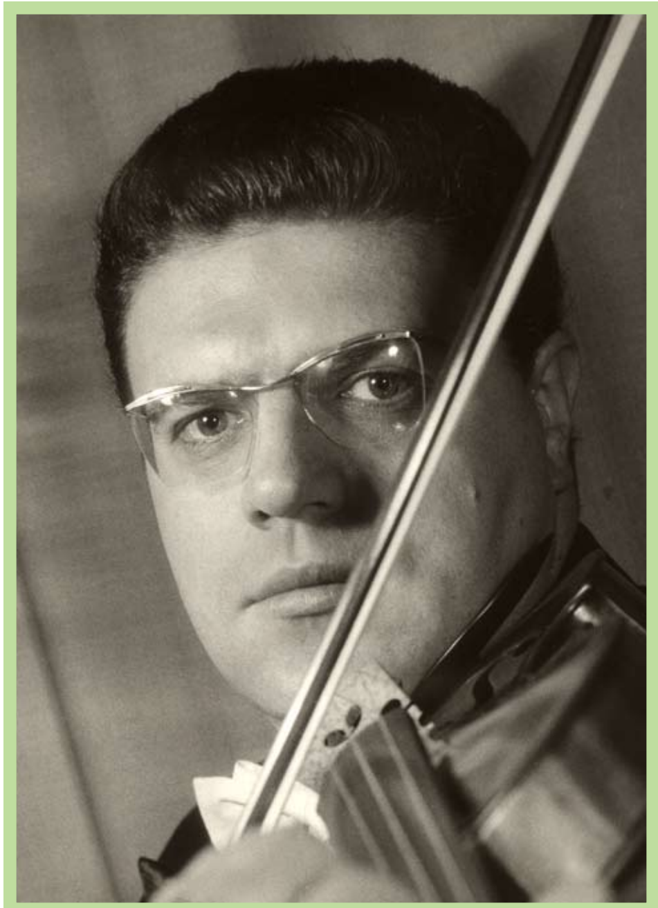
The great Czech violin virtuoso, Josef Suk, is the great-grandson of composer Anton Dvorak.

VIOLIN SONATAS. Violin Sonatas by such composers as Bach, Beethoven, Brahms, Debussy, Faure, Franck, Grieg, Handel, Mozart, Schubert, Schumann, Strauss, Tartini, and many others.