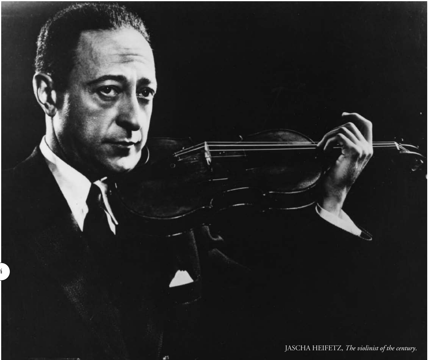
JASCHA HEIFETZ, The violinist of the century.