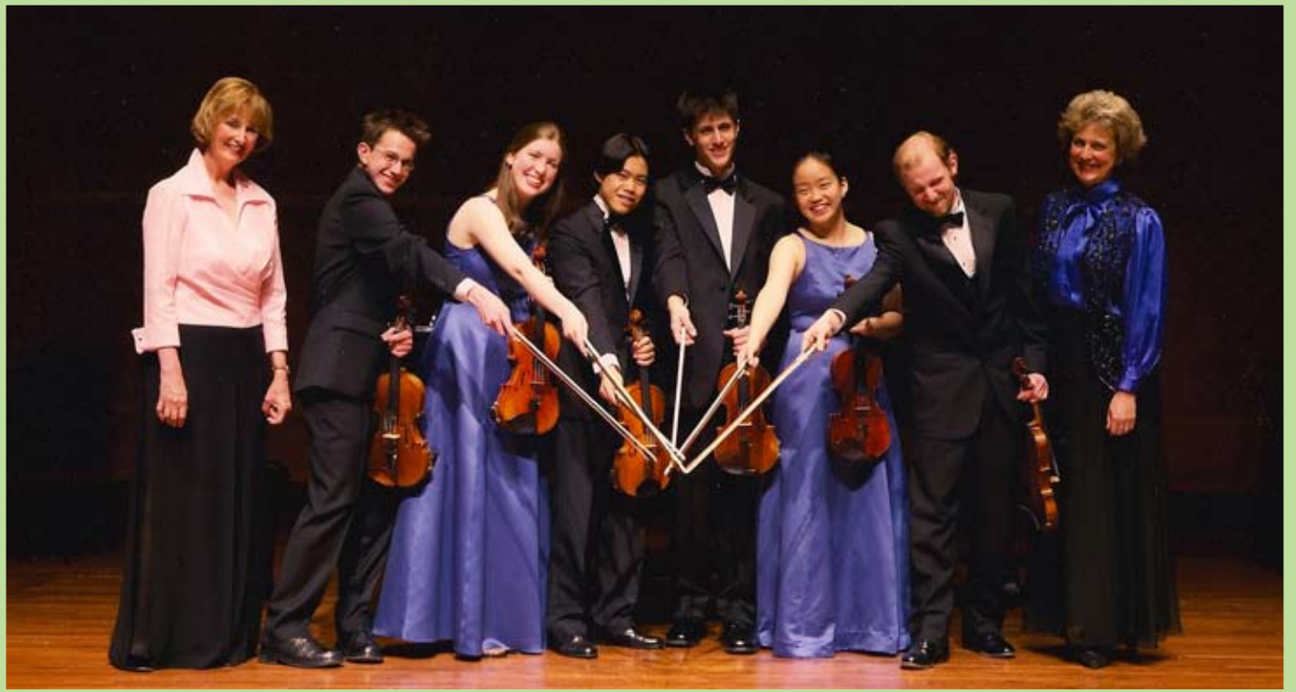
Seattle's Dorothy Richard Starling Violin Scholars

INTERMISSIONS: Could you also talk about how you teach your students to structure their practicing?